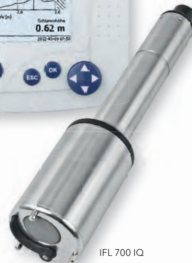
IFL 700 IQ