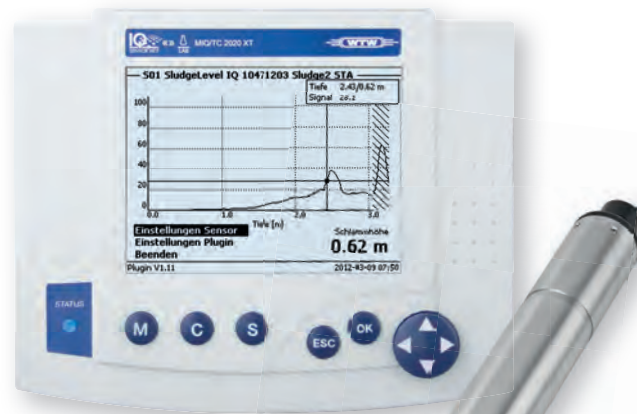
Echo profile on the 2020 XT